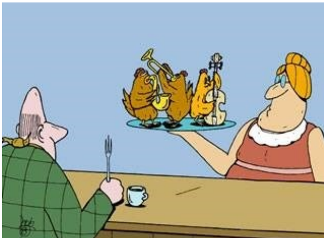
Three-piece Chicken Combo